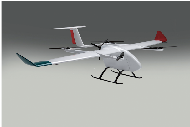
Fig. 3. The latest VTOL-UAV aircraft (ASUKA Mk 5) developed in 2022.