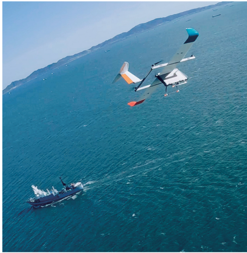
Fig. 1. VTOL-ASUKA (Mk 4 Type 2) during vertical take-off from the research vessel in Mikawa Bay on 27 March 2022.